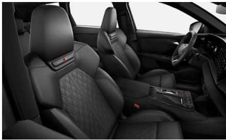
Interior S with sports seats plus, black leather