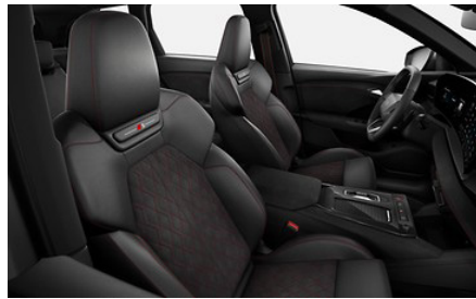
Interior S with sports seats plus, microfiber Dinamica/leather combination. Black, colored stitching red Audi Sport GmbH