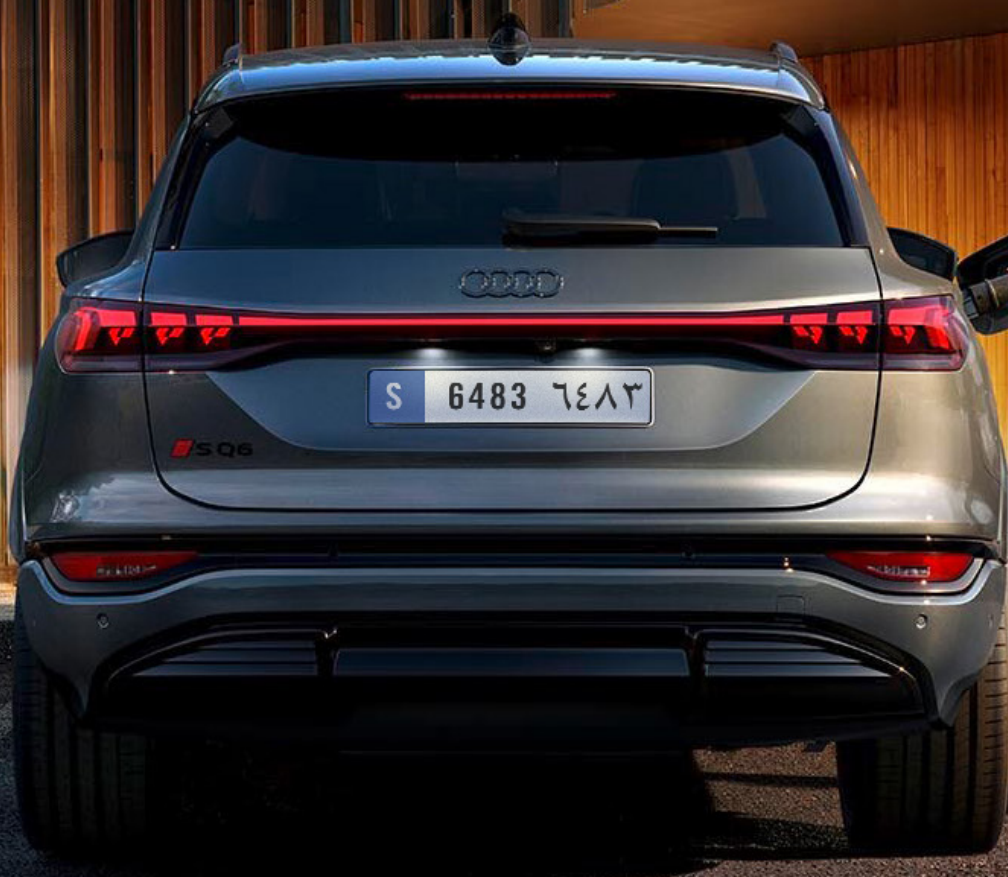
Audi SQ6 e-tron 2025

A word about this brochure. Audi Middle East believes the specifications in this brochure to be correct at the time of launch. However, specifications, standard equipment, options, fabrics, and colors are subject to change without notice. Some equipment may be unavailable when your vehicle is built. Please ask your dealer for advice concerning current availability of standard and optional equipment, and your dealer will verify that your vehicle will include the equipment you ordered. Vehicles in this brochure are shown with optional equipment. See your dealer for complete details on all warranties, service and maintenance plans and aftersales programmes on offer in your region.