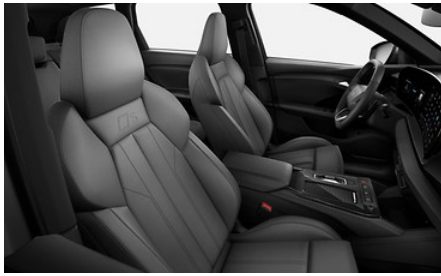
Interior S with sports seats, leather/synthetic leather combination grey