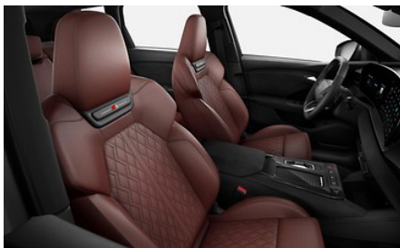
Interior S with sports seats plus, red leather