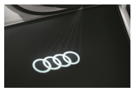
The Audi LED door-entry lights beam a high-quality Audi ring logo on the ground when the door is open.