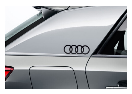
The Audi ring logo can be installed on the C-pillar to set your Audi Q2 apart on the road.