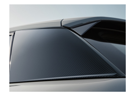
The decorative trim in high-quality carbon for the C-pillar accentuates the individual character of your Audi Q2.