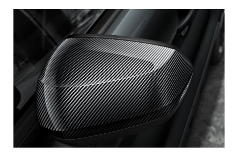
Enhance the visual appeal of your Audi Q2 with the optional high-quality carbon set.